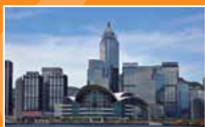
Hong Kong voted the Best City for Business Events (Page 3)