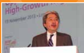
Financial Secretary, John C Tsang, visits London (Page 2)